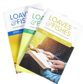
Our five year topic outline

Here are some of the topics that we hope to cover in upcoming issues of the magazine, not necessarily in order. Please pray for our staff as we compile content for each of these vital topics.