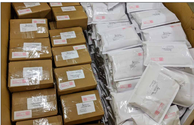
2020 Calendar Mailing