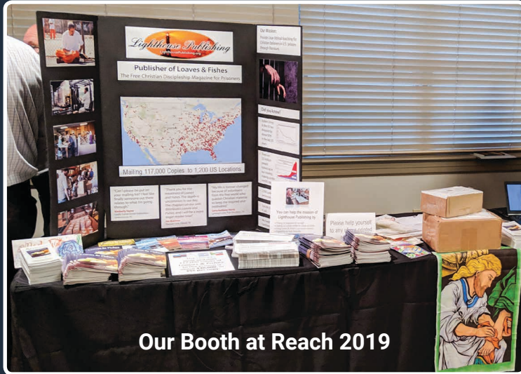
Our Booth at Reach 2019