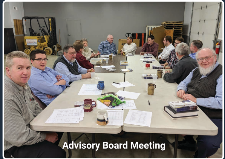
Advisory Board Meeting